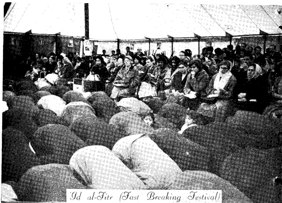
Id al-Fitr (Fast Breaking Festival) Monday, 28th March, 1960 C.E.